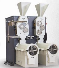
Roller Mill 4500